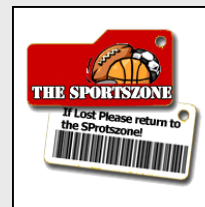
Key Tag Size

For more information please call 1-800-976-6646 or email us at info@maxsolutions.com