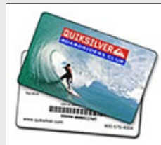
Credit Card Size

Credit card sized: $925.00 for 2500 cards Key Tag sized: $625.00 for 2500 cards