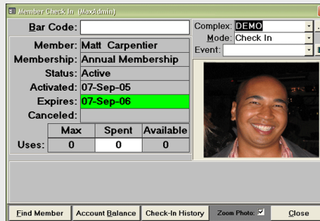
Membership Check-in Screen